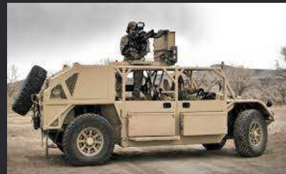
FOSOV Ground Platforms