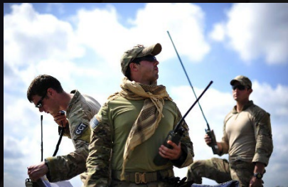
C4I Repair and Return