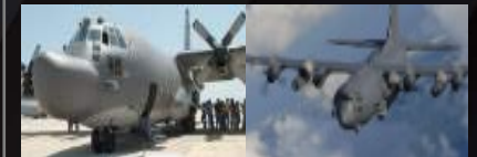
AC / MC-130J Production / Mods