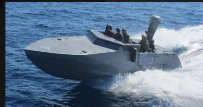
Surface Combatant Craft