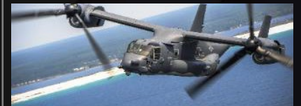
CV-22 Integration & Maintenance